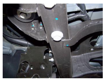
7. Install rear tailpipe hanger #I. Remove hitch bolt as seen in picture. Insert rubber grommet on hanger.

6. Install tailpipe #D into muffler 1.5-2" and secure with clamp #H. Do not tighten. Insert welded hanger into rubber grommet.