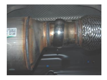
2. To remove stock exhaust, unclamp it at the ball flange behind the Y-pipe. Make sure to leave all rubber grommets in the factory location. You will re-use stock clamp. For easier removal of exhaust, cut behind the muffler. Use WD-40 to remove hangers from grommets.

1. Disconnect the negative battery cable before removal of OEM exhaust. This will allow the computer to reset and recognize the new exhaust. Lay out the exhaust on the floor so it looks like the drawing and compare parts with manual.