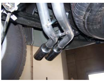
6. Now install driver side tailpipe #D. The spare tire may need to be loosened and pushed to the driver side to allow for clearance. Use bolt kit #H to attach both tailpipes together.