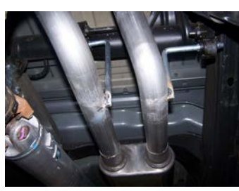
7. Using clamps #G secure both tailpipes to the outlets of the muffler. Rotate tailpipes to best fit your truck.