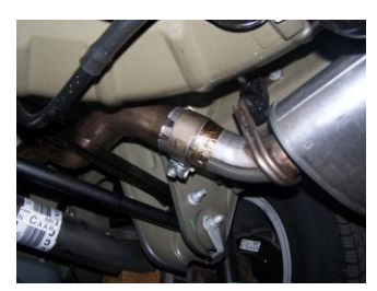
1. Remove your stock assembly from the clamp located in front of your stock muffler, unbolt the factory hangers from the frame.