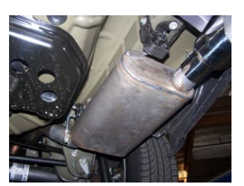
3. Install muffler assembly onto factory pipe, use clamp #B to secure. DO NOT TIGHTEN. Next tighten grommets to frame and adjust muffler assembly.