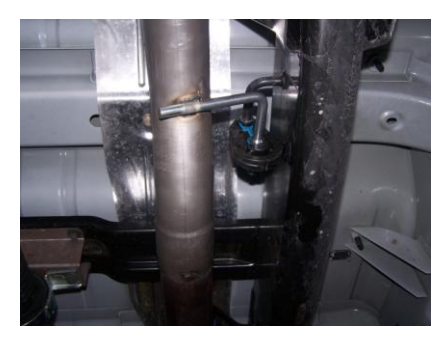
INSTALL HEADPIPE #A, YOU WILL NEED TO LINE UP THE TWO NOTCHES. INSERT WELDED HANGER INTO RUBBER GROMMET. USE CLAMP #G TO SECURE HEADPIPE TO THE STOCK PIPE. DO NOT TIGHTEN.

"MAKE SURE YOU HAVE A 1" CLEARANCE ON ALL PIPES AWAY FROM BRAKE LINES, FUEL LINES, SHOCKS, TIRES, ETC..."