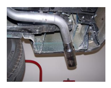
8. Install exit pipes #E onto tailpipes and secure with clamps #H. Do not tighten.