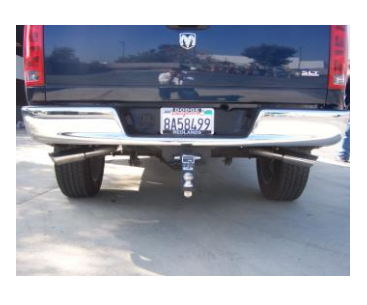
9. Install stainless steel tips. Clamp down. When you have everything in place, firmly tighten all bolts and clamps down securely. Use stainless steel cleaner and a Scotch Brite pad weekly to prevent tip from discoloration. Inspect all fasteners after 25-50 miles of operation and re-tighten as necessary.