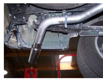
7. Install the driver side over axle tailpipe #D into the muffler 1.5-2". Use clamp #H to secure. Use another clamp #H to hold pipe up to hanger. Do not tighten. Insert welded hanger into rubber grommet.

3. Install headpipe #A onto your existing stock headpipe and attach with clamp #I. Do not tighten. Use a jack stand to support the converter.