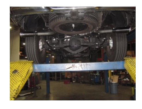
7. Install exit pipes #E onto tailpipes use clamp # F to secure together. After everything is installed begin to tighten all connections starting from the furthest forward connection. Items will move as you tighten. Be sure to check all clearance.

"MAKE SURE YOU HAVE A 1" CLEARANCE ON ALL PIPES FROM ALL RUBBER BRAKE LINES, SHOCK BOOTS, TIRES, ETC..." TORQUE ALL CLAMPS TO APPROX. 100 TO 150 FT LBS.