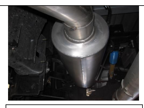
3. Install muffler #B onto headpipe 1.5" to 2" muffler outlets should be on top and level use clamp #G to secure together. Do not tighten. Insert hangers into rubber grommets