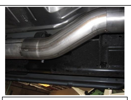
2.Install headpipe #A onto your factory pipe using clamp #G insert welded hanger into the rubber grommet leave clamp loose.

1. Disconnect the negative battery cable before removal of the OEM Exhaust. This will allow the computer to reset and recognize the new exhaust. Lay out the exhaust on the floor so it looks like the drawing and compare parts with manual. Remove the factory exhaust by cutting behind the factory muffler. Once the tail pipe has been removed un-bolt the muffler and head pipe at the clamp located in front of the factory muffler. Use wd-40 or another type of penetrating oil to remove the rubber grommets. Do not damage these they will be re used.