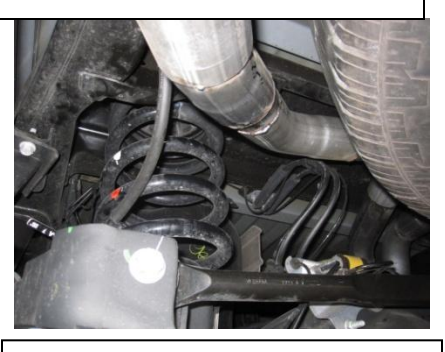
4.Next install Drivers side overaxle tailpipe #C into muffler 1.5" to 2" use clamp #F to secure pipe to muffler do not tighten