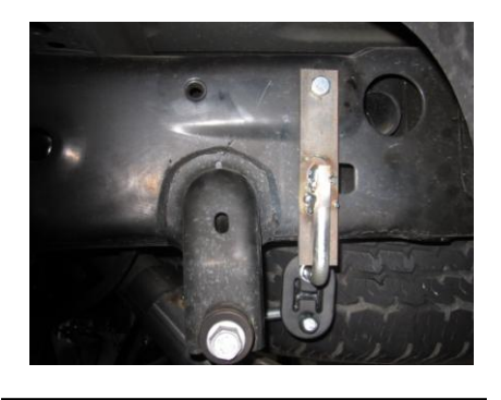
5. Next install drivers side rear hanger and grommet with bolt kit on the outside of the driver side frame rail. Use the factory drilled hole just forward of the large hole seen in the photo above.