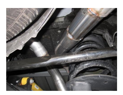
6.Next install passenger side tailpipe # D into muffler 1.5"to 2" insert welded hangers into rubber grommets use clamp #F to secure pipe together do not tighten