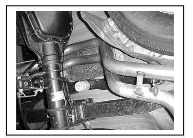
NEXT INSTALL DRIVERS OVER AXLE PIPE # D INTO MUFFLER 1½ TO 2".USE CLAMP # F TO SECURE PIPE TO MUFFLER. DO NOT TIGHTEN. USE BOLT KIT # H TO SECURE PIPES TOGETHER. DRIVERSIDE TAB WILL BE ON THE BOTTOM.

INSTALL DRIVER SIDE OVER AXLE TAILPIPE # D INTO MUFFLER 1½ TO 2". INSERT WELDED HANGER INTO RUBBER GROMMET, USE CLAMP # G TO SECURE PIPE TO MUFFLER. THIS PIPE WILL GO INTO THE DRIVERS SIDE OUTLET. DO NOT TIGHTEN