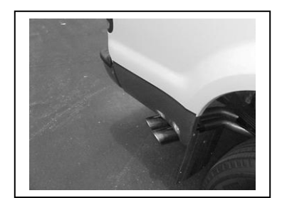
INSTALL YOUR BLACK CERAMIC COATED TIPS. PROCEED TO THE NEXT SHEET ON HOW TO INSTALL YOUR DEEGAN 38 BADGES. AFTER YOU HAVE CHECKED FOR CLEARANCES GO BACK AND TIGHTEN ALL NUTS,

SLIP MUFFLER #B ONTO THE HEADPIPE 1 ½" TO 2". THE OUTLETS WILL BE LEVEL. USE CLAMP #G TO SECURE MUFFLER TO HEADPIPE. DO NOT TIGHTEN.