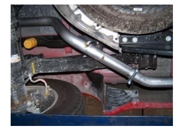
4. Install the passenger side overaxle tailpipe #C into the muffler 1½"-2". Use clamp #H to secure tailpipe to muffler. DO NOT TIGHTEN. Insert hanger into rubber grommet.

7. Next install the exit pipes #E. Use clamp #H, rotate pipes to the side. Trim ends of exitpipe to best fit your vehicle.