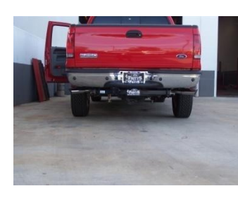
9. Install stainless steel tips. Clamp down. When you have everything in place, firmly tighten all bolts and clamps down securely. Use stainless steel cleaner and a Scotch Brite pad weekly to prevent tip from discoloration. Inspect all fasteners after 25-50 miles of operation and re-tighten as necessary