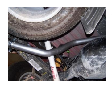
6. Install the driverside overaxle tailpipe #D into the muffler 1½-2". Use clamp #H to secure. DO NOT TIGHTEN. Rotate until it meets with the rubber grommet, use clamp #H to hold pipe. DO NOT TIGHTEN.