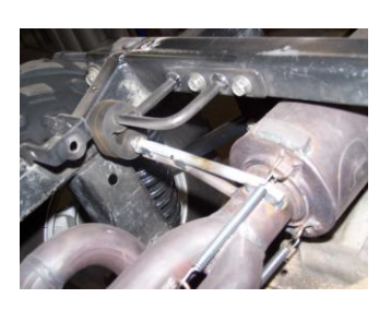
7. To install your Gibson exhaust, first install your header. Re-use the stock nuts to bolt the flanges onto the head. Do not tighten the bolts until the complete system is installed.

6. Next, unbolt the 2 flanges at the head and remove header. Do not throw away stock nuts, you will re-use them. (Lay the stock header sideways in front of sway bar and brake caliper in order to have room to slide the stock muffler out.)