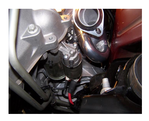
17. RE-CONNECT THE EXHAUST SYSTEM TO THE NEW HEADERS USING THE HARDWARE PROVIDED.