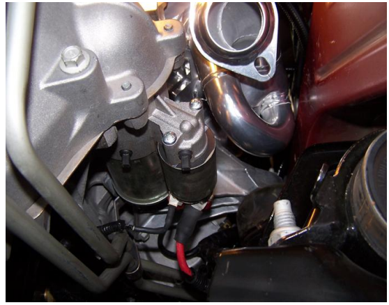
TORQUE DOWN BOLTS STARTING WITH THE CENTER BOLTS FIRST. RECOMMENDED TORQUE SPECS. ARE 25-30 FOOT POUNDS OF TORQUE.

17. RE-CONNECT THE EXHAUST SYSTEM TO THE NEW HEADERS USING THE HARDWARE PROVIDED.