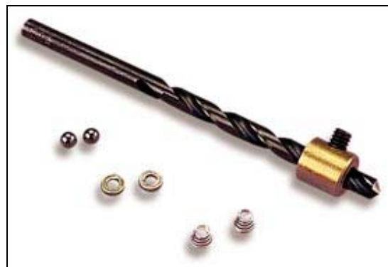
Figure 2 (Kit Components)

NOTE: The drill collar is pre-set, but if it should come loose, it must be set .300" from the drill tip.