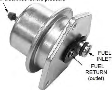
Ford 5.0L Fuel Pressure Regulator Figure 1

Fuel Pressure Adjustment Knob Requires Flat Head Screwdriver Clockwise raises pressure Counter-clockwise lowers pressure