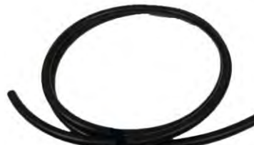
1/4" ID, 1/2" OD Tubing – 6 ft