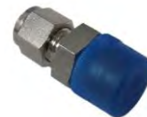
Stainless 3/8" NPT -1/4" OD tube fitting