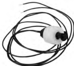
Low Level Float