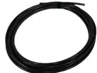
Polyurethane 1/4" OD tubing – 16 ft