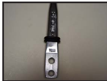
Step 2. Remove boot from stock plastic ring. Slip both o-rings on shifter stick. Place at desired location.