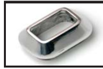
BILLET BOOT SUPPORT