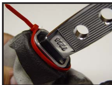
Step 5. Slip Billet Boot Support back into boot. If necessary, cut boot ring opening to allow support to fit in boot. Use provided tie wrap to tie new boot support to boot.