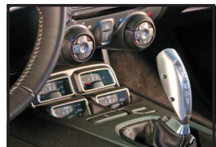
Enjoy! (Hard Drive Stick with Billet Boot Support shown)