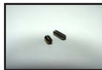
3/8" & 1/4" LENGTH SETSCREW

part no. 2970520 part no. 2970521 qty. 1 ea.