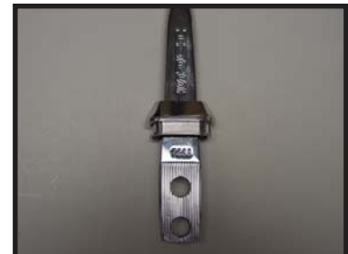
Step 3. Slide the Billet Boot Support over o-rings.