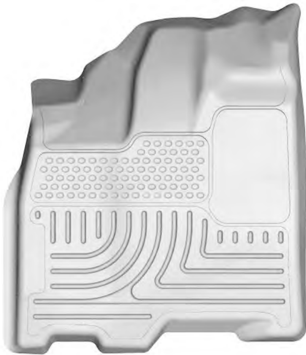
LEFT OR DRIVER'S