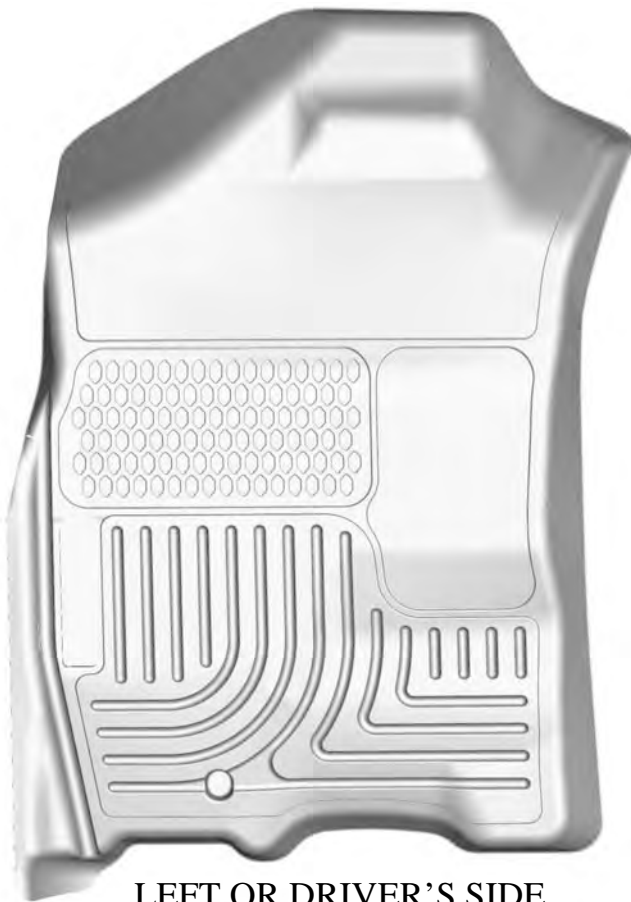
LEFT OR DRIVER'S SIDE