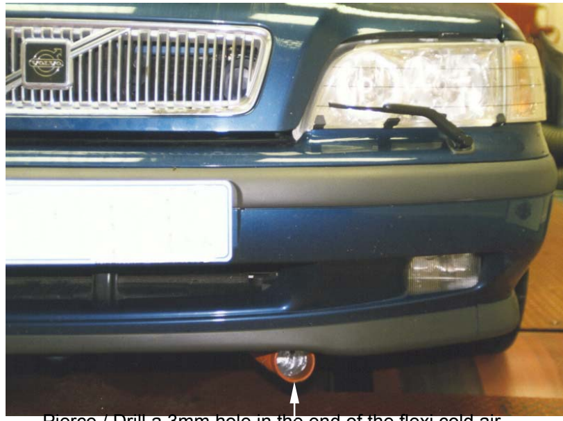
Pierce / Drill a 3mm hole in the end of the flexi cold air hose and the lower spoiler. Ovalise the end of the hose then tie this to the lower spoiler with the long plastic tie.