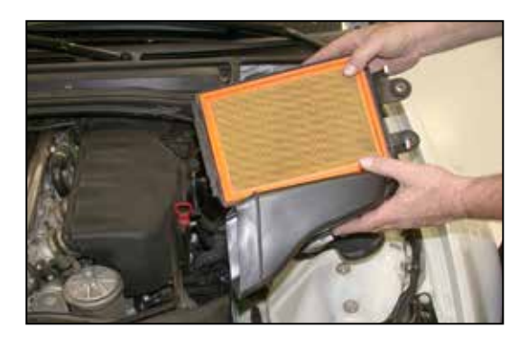
7. Remove the lower air box assembly as shown. NOTE: K&N Engineering, Inc., recommends that customers do not discard factory air intake.