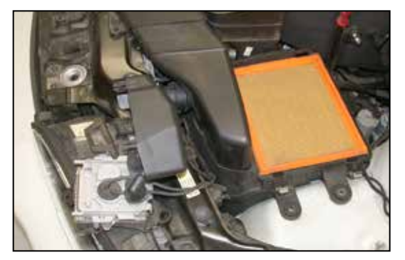
6. Lift the head light module and place out of the way on the core support to gain access to the lower air box for removal.

5. Remove the cover to the head light module to gain access to the air box bolts and module nut. Remove the bolts and nut.