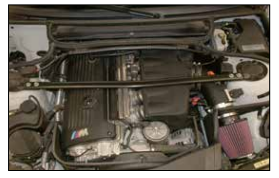
26. Re-install the strut tower brace that was removed in step 2.