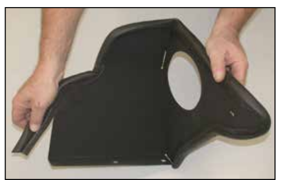
11. Install the edge trim onto the heat shield as shown.