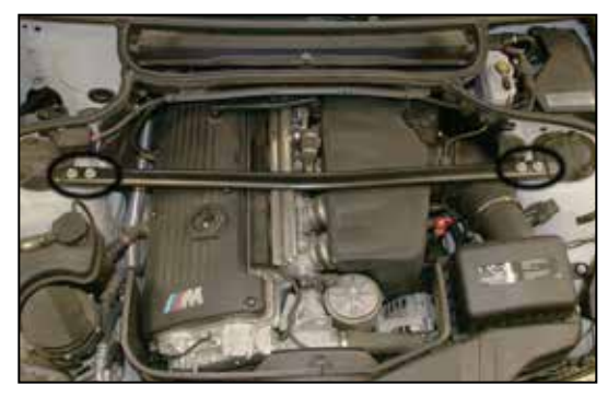
2. Remove the four 13mm nuts that secure the strut tower brace to the vehicle, then remove the brace from the vehicle.

3. Squeeze the two locking tabs together, then remove the mass air electrical connection as shown.