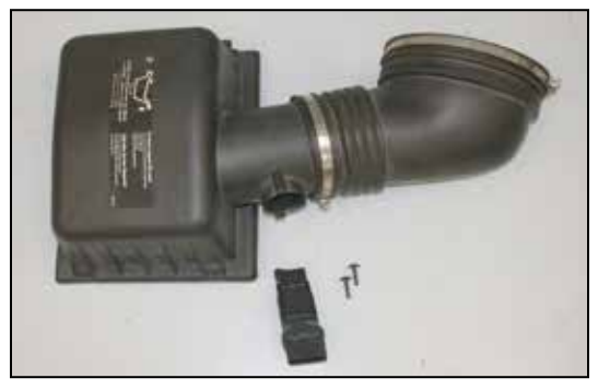
16. Remove the two screws that secure the mass air sensor to the air box with the provided Torx wrench, then remove the mass air sensor.