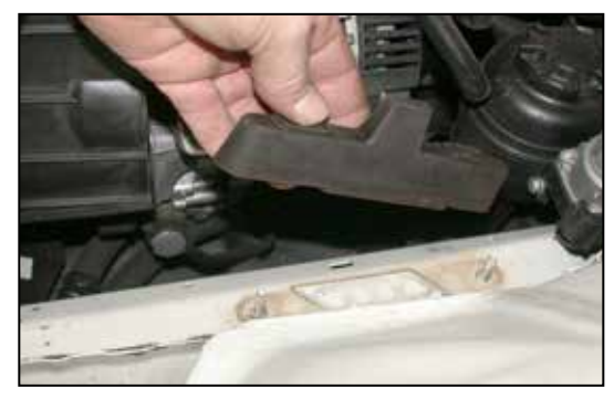
8. Lift up on lower air box mount and then remove from vehicle.