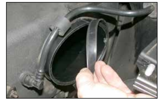
10. Remove the intake o-ring from the plenum as shown.