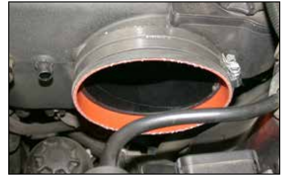
15. Install the silicone hose (08612) onto the intake plunem as shown using the provided hose clamps.