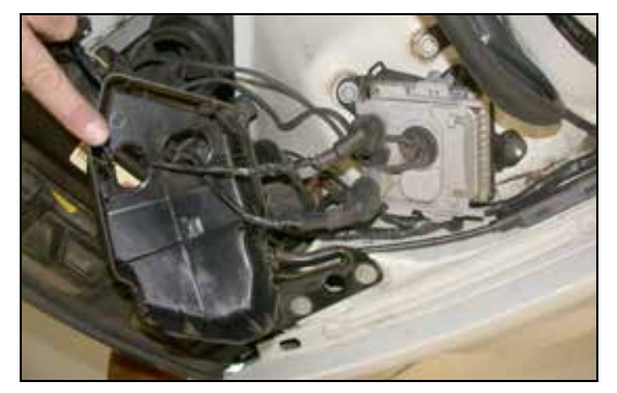
14. Re-install the head light module with the original hardware that was removed in step 5. NOTE: Install provided spacer under front mount as shown, then re-install module cover.

NOTE: Use bolt that was removed in step 5 to secure the bracket to the inner fender.