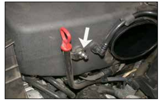
9. Remove the nut that secures the dip stick to the intake plenum.