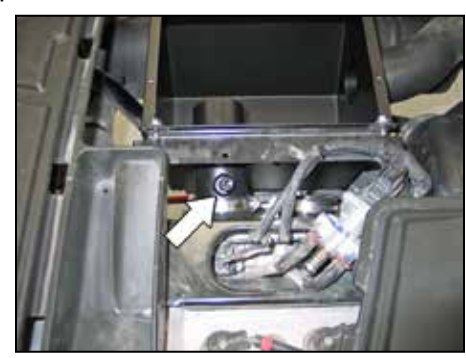
18. Install the provided npt vent fitting into the K&N® intake tube.