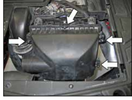
4. Loosen the five air box retaining nuts and release the retaining nuts.

3. Loosen the hose clamp securing the fresh air intake hose to the air box and then disconnect the fresh air intake hose from the air box.