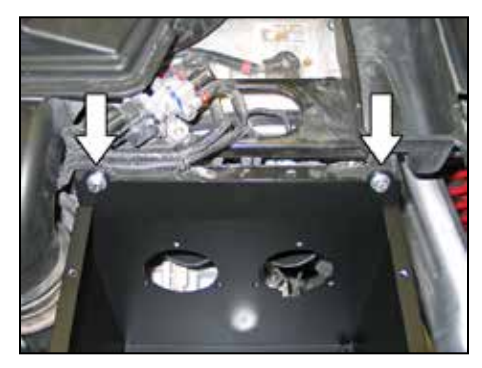
16. Secure the top of the air box to the mounting bracket with the provided hardware and then tighten the lower mounting nut and hose clamp securing the fresh air intake hose.