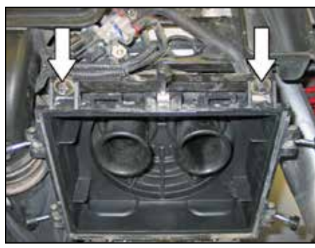
7. Remove the two bolts securing the air box to the mounting bracket.

6. Loosen the two hose clamps securing the factory air horns to the throttle bodies.