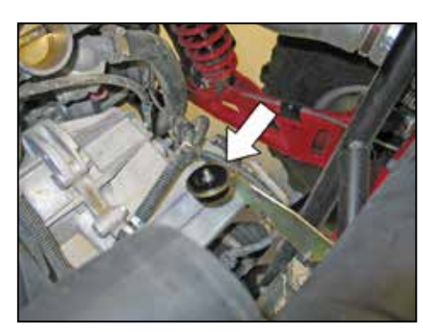
11. Assemble the heat shield mount onto the air box mounting bracket.