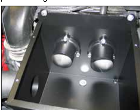
20. Install the left side intake tube (27548) through the heat shield and into the silicone hose on the throttle body, and then secure with the provided hardware and hose clamp.