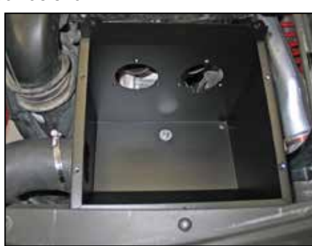
15. Install the air box into the vehicle so that the stud protrudes through the hole on the bottom and the fresh air supply hose is installed onto the air box tube. Then install the lower mounting hardware but do not completely tighten at this time.