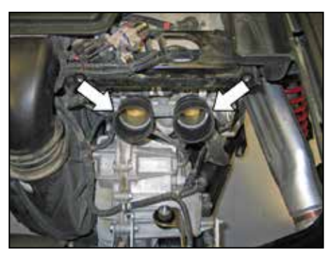
13. Install the silicone hoses (08476) onto the throttle bodies and secure with the provided hose clamps.