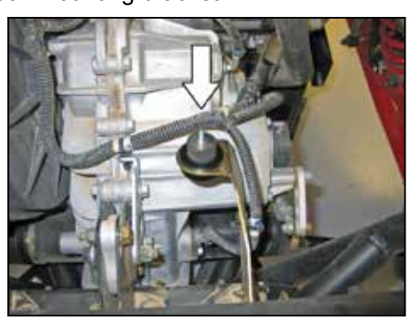
12. Install the rubber mounted stud onto the heat shield mount as shown.