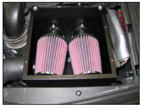
21. Install the K&N® air filters onto the intake tubes and secure with the provided hose clamps.