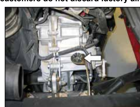
10. Remove the lower air box mounting grommet shown.

NOTE: K&N Engineering, Inc., recommends that customers do not discard factory air intake.