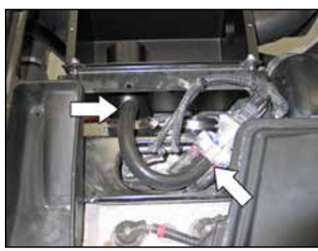
19. Install the provided idle by-pass hose onto the npt vent fitting and then onto the idle solenoid.