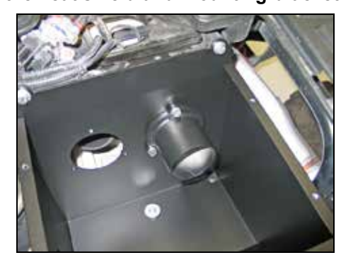
17. Install the right side intake tube (27547) through the heat shield, rotate 180* and then install into the silicone hose at the throttle body. Secure the intake tube with the hose clamp and hardware provided.