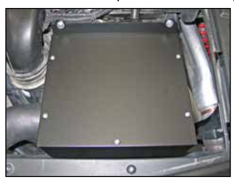
22. Install he air box lid and secure with the provided hardware.