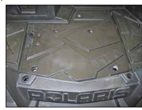
23. Reinstall the engine access panel.