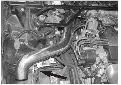
12. Slide the K&N® Typhoon® short ram tube into the silicone hose at the throttle body, then line up the bracket with the rubber mounted stud as shown.

NOTE: Before securing the "Z" bracket, inspect the inside of the tube for any debris, then clean the inside out with water and a towel. Inspect the tube one more time before proceeding to the next step.