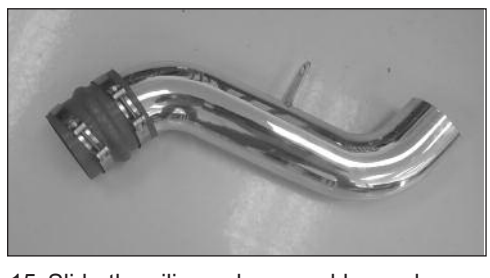
15. Slide the silicone hose and hose clamps onto the K&N® Typhoon® cold air tube as shown.

NOTE: Before installing the silicone hose and hose clamps, inspect the inside of the tube for any debris, then clean the inside out with water and a towel. Inspect the tube one more time before proceeding to the next step.