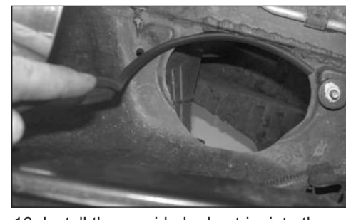
16. Install the provided edge trim into the hole in the inner fender as shown.

NOTE: Before installing the silicone hose and hose clamps, inspect the inside of the tube for any debris, then clean the inside out with water and a towel. Inspect the tube one more time before proceeding to the next step.