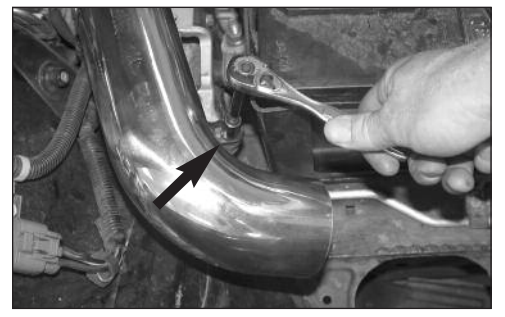
13. Using the provided hardware, secure the "Z" bracket to the rubber mounted stud as shown but do not tighten completely at this time.