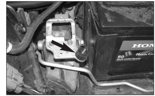
10. Install the rubber mounted stud into the stock bracket on the inner fender as shown.