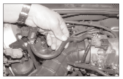
4. Remove the EVAP vent hose from the rubber clip on the intake tube as shown.

6. Remove the stock intake tube from the air cleaner assembly, then, pull the intake tube off of the throttle body as shown.