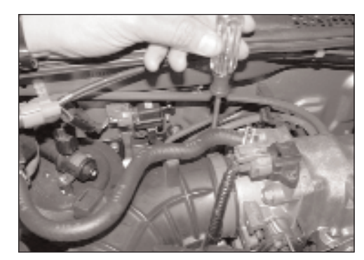
5. Loosen the hose clamp at the throttle body as shown.