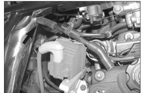
22. Slide the provided silicone hose onto the stock crank case vent hard line, then, secure the other end to the vent on the K&N® typhoon® short ram tube as shown.