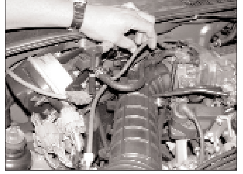
3. Remove the vacuum hose from the rubber clips on the stock intake tube as shown.