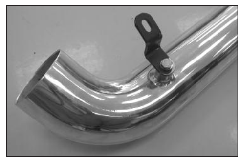
11. Using the provided hardware secure the provided "Z" bracket to the K&N® Typhoon® short ram tube as shown.

NOTE: Before securing the "Z" bracket, inspect the inside of the tube for any debris, then clean the inside out with water and a towel. Inspect the tube one more time before proceeding to the next step.