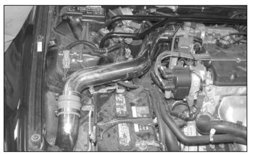
19. Align everything for best fit and clearance then tighten all hose clamps and hardware.

18. Using the provided hardware secure the bracket to the rubber mounted stud as shown.