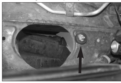
14. Install the rubber mounted stud into the air cleaner mounting hole as shown.