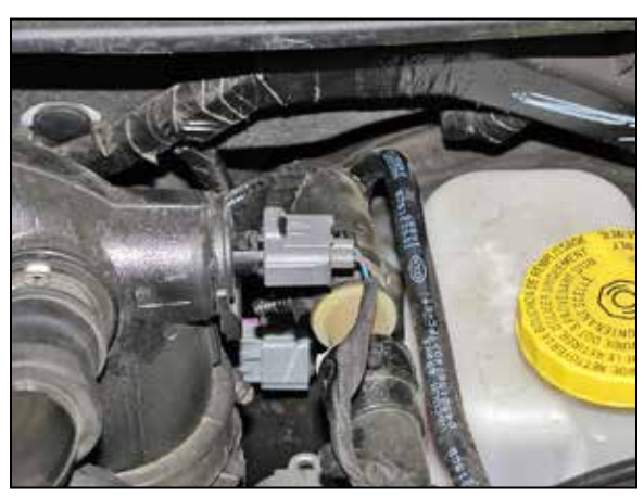
3. Disconnect the inlet air temperature sensor electrical connection.