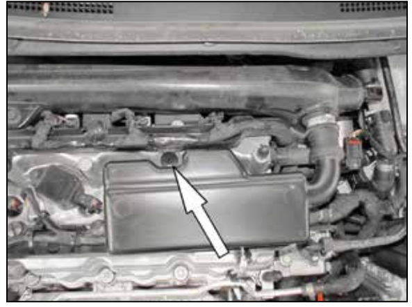
4. Remove the push pin that secures the resonator chamber onto the valve cover.