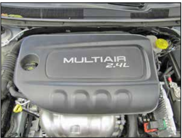
2. Lift up and remove the decorative engine cover.

1. Turn off the ignition and disconnect the negative battery cable. NOTE: Disconnecting the negative battery cable erases pre-programmed electronic memories. Write down all memory settings before disconnecting the negative battery cable. Some radios will require an anti-theft code to be entered after the battery is reconnected. The anti-theft code is typically supplied with your owner's manual. In the event your vehicles anti-theft code cannot be recovered, contact an authorized dealership to obtain your vehicles anti-theft code.