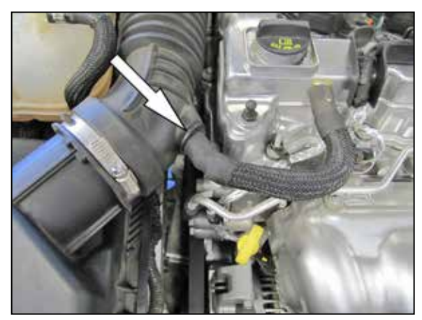
5. Disconnect the crank case vent hose from the factory intake tube.