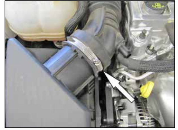
6. Loosen the hose clamp that secures the intake tube to the air filter housing.