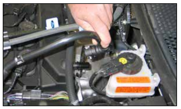
3. Release the locking tab and then disconnect the crankcase vent line from the rear of cam cover as shown.

NOTE: Disconnecting the negative battery cable erases pre-programmed electronic memories. Write down all memory settings before disconnecting the negative battery cable. Some radios will require an anti-theft code to be entered after the battery is reconnected. The anti-theft code is typically supplied with your owner's manual. In the event your vehicles anti-theft code cannot be recovered, contact an authorized dealership to obtain your vehicles anti-theft code.