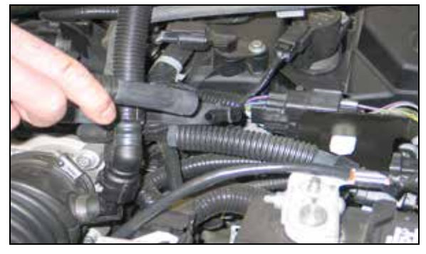
4. Remove EVAP hose from the EVAP valve as shown.

2. Disconnect the mass air sensor electrical connection.