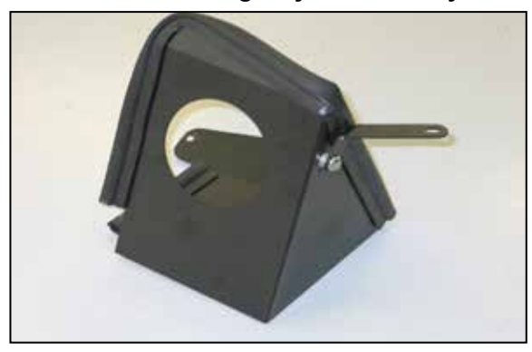
17. Install heat shield mounting bracket (083135) with provided hardware onto heat shield as shown.