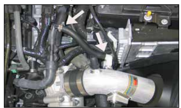
24. Install provided silicone hose onto the EVAP valve with provided hose clamp then onto 90° fitting on K&N<sup>®</sup> intake tube.