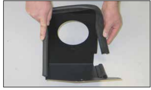
16. Attach long edge trim to heat shield as shown. NOTE: Some trimming maybe necessary.

15. Attach short edge trim to heat shield as shown. NOTE: Some trimming maybe necessary.