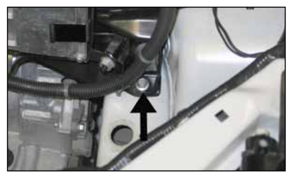
10. Remove bolt shown securing the ECU bracket. NOTE: bolt will be reused.

9. Remove airbox grommet from inner fender well as shown.