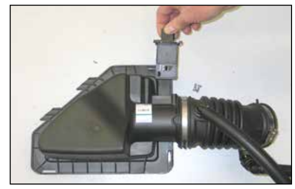
21. Remove mass air sensor from factory airbox lid as shown.