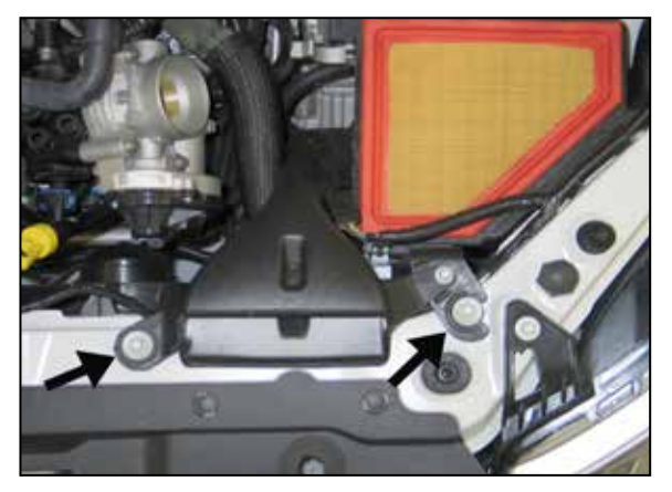
7. Remove the two bolts securing the lower airbox assembly to core support.