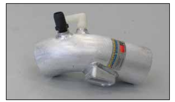
20. Install the 5/8" vent fitting into the K\&N^{\ensuremath{\$}} intake tube as shown.