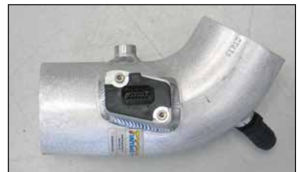
22. Install mass air sensor into K&N<sup>®</sup> intake tube and secure with the provided hardware as shown.