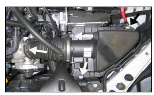
5. Release the three retaining clips securing the airbox lid and loosen the hose clamp at the throttle body.