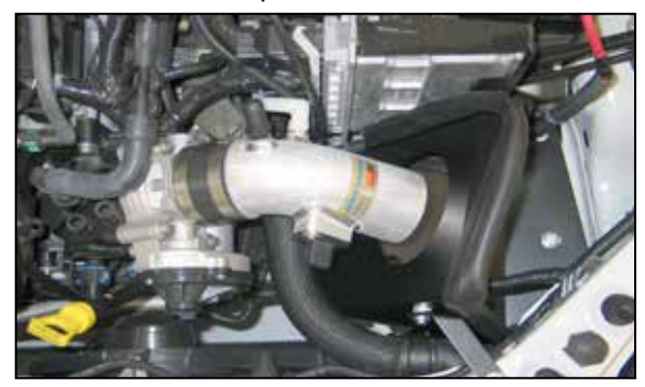
23. Install K&N<sup>®</sup> intake tube into silicone hose and aligning with tube mounting bracket and heat shield. Secure with provided hardware as shown.