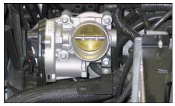
11. Remove bolt shown from throttle body. NOTE: bolt will be reused.

12. Install tube mounting bracket (083136) onto the throttle body using bolt removed from the previous step.