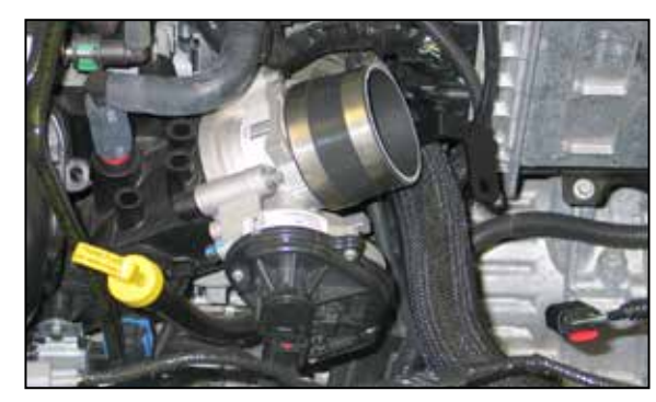
13. Install silicone hose (08440) with provided hose clamps onto the throttle body as shown.