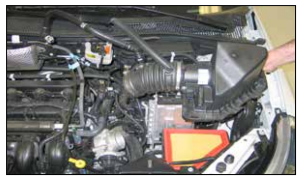
6. Remove factory intake hose and airbox lid from the vehicle.