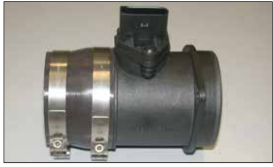
14. Install the silicone hose and hose clamps onto the mass air sensor as shown.