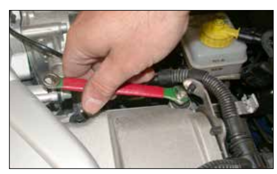
11. Loosen the nut on the cam cover but do not remove as shown.