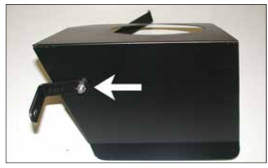
17. Install the "L" bracket onto the heat shield using the provided hardware as show, but do not tighten completely at this time.