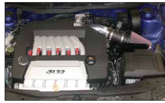
24. Reconnect the vehicle's negative battery cable. Double check to make sure everything is tight and properly positioned before starting the vehicle.