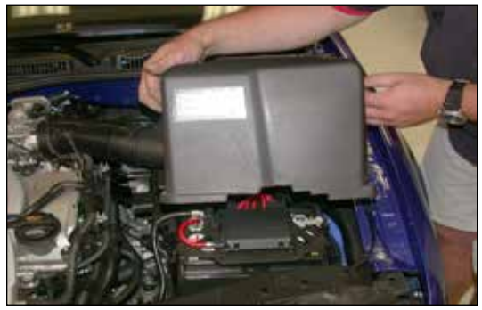
3. Unclip the battery cover and remove as shown.