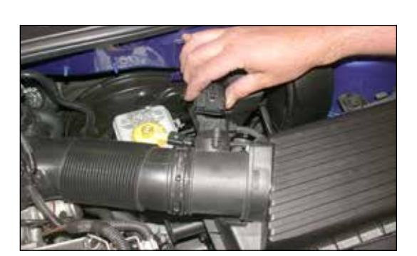
4. Disconnect the mass air sensor electrical connection as shown.