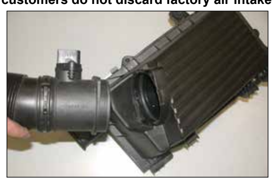
9. Remove the mass air sensor from the air cleaner assembly as shown.