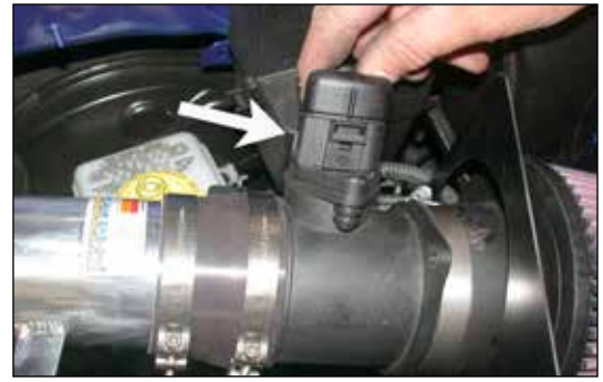
22. Reconnect the mass air sensor electrical connection as shown.