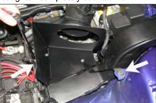
18. Install the heat shield into the vehicle and secure it using the stock air cleaner bolts, adjust for best fit and clearance and tighten all hardware.