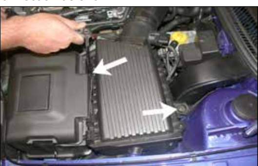
5. Remove the two air cleaner bolts as shown.