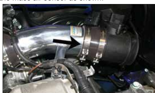
15. Slide the mass air assembly onto the K&N intake tube, but do not tighten at this time.