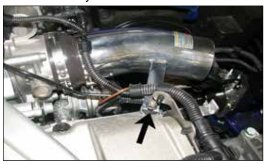
13. Slide the intake tube into the silicone hose on the throttle body, then, line up the bracket with the stud from step 11 as shown.