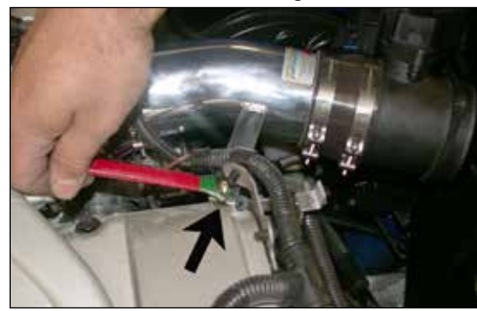
19. Adjust the tube for best fit and clearance and tighten the nut on the cam cover as well as the hose clamps on the intake tube as shown.