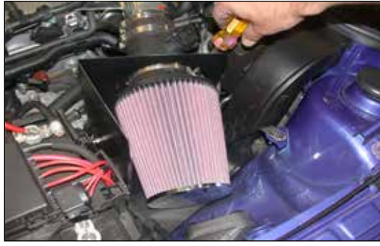
20. Install the air filter and secure with the provided hose clamp.