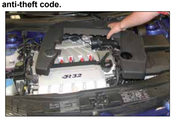
2. Pull firmly upwards to remove the engine cover

NOTE: Disconnecting the negative battery cable erases pre-programmed electronic memories. Write down all memory settings before disconnecting the negative battery cable. Some radios will require an anti-theft code to be entered after the battery is reconnected. The anti-theft code is typically supplied with your owner's manual. In the event your vehicles' anti-theft code cannot be recovered, contact an authorized dealership to obtain your vehicles