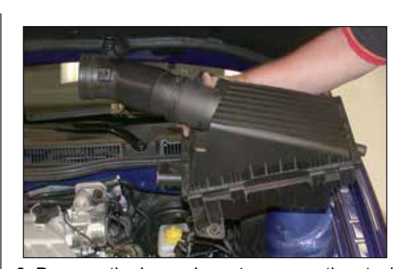
8. Depress the hose clamp to remove the stock intake tube from the throttle body, then, remove the complete air cleaner assembly as shown. NOTE: K&N Engineering, Inc., recommends that customers do not discard factory air intake.