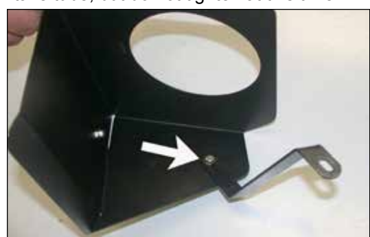
16. Install the "Z" bracket onto the heat shield using the provided hardware as show, but do not tighten completely at this time.