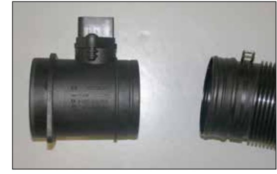
10. Remove the intake tube from the mass air sensor as shown.