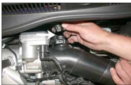
7. Remove the crank case vent hose from the intake tube as shown.