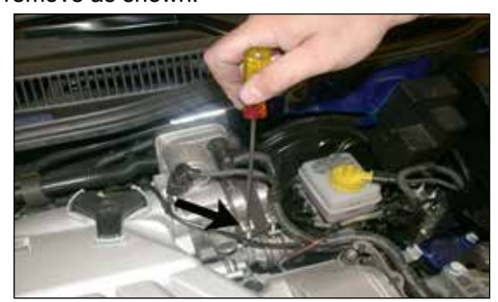
12. Install the silicone hose and hose clamps onto the throttle body as shown.