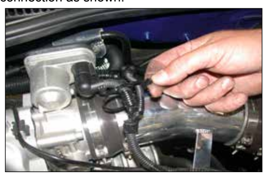
23. Zip-tie the crank case vent switch to the throttle control connection as shown.