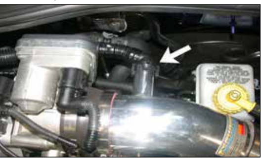
21. Reconnect the crank case vent hose to the vent on the K&N® intake tube.