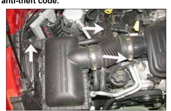
2. Loosen the hose clamp at the intake plenum and the air box mounting nut, and then disconnect the crank case vent hose from the "tee" fitting.

NOTE: Disconnecting the negative battery cable erases pre-programmed electronic memories. Write down all memory settings before disconnecting the negative battery cable. Some radios will require an anti-theft code to be entered after the battery is reconnected. The anti-theft code is typically supplied with your owner's manual. In the event your vehicles anti-theft code cannot be recovered, contact an authorized dealership to obtain your vehicles anti-theft code.