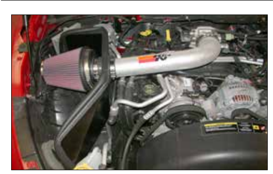
27. Reconnect the vehicle's negative battery cable. Double check to make sure everything is tight and properly positioned before starting the vehicle.