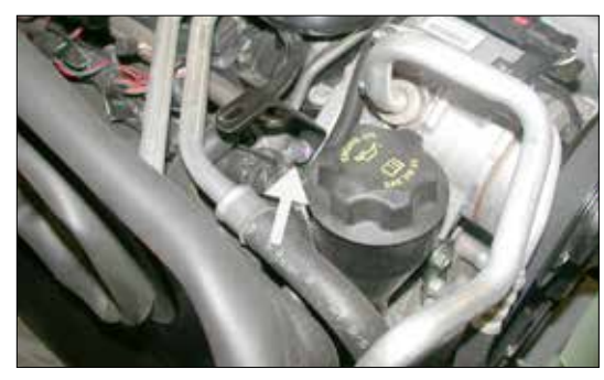
15. Install the tube mounting bracket (010119) onto the A/C compressor using the bolt removed in step #14 as shown.