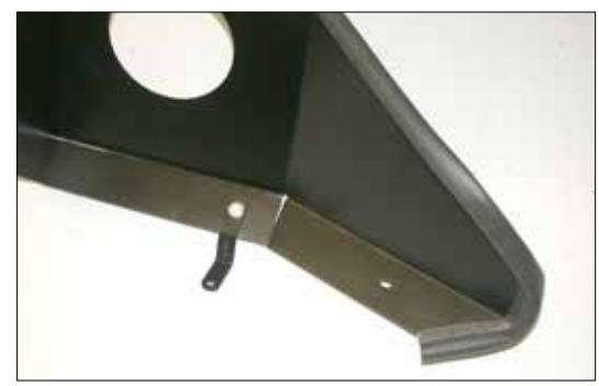
9. Install the "Z" bracket (010120) onto the heat shield with the provided hardware as shown.