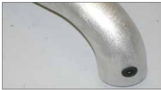
18. Install the provided grommet into the K&N<sup>®</sup> intake tube as shown.