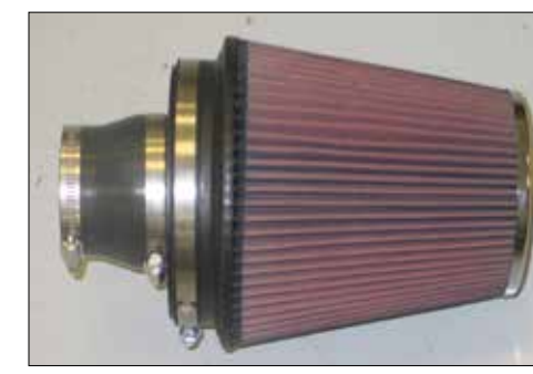
25. Install the silicone hose (084055) onto the air filter adapter as shown and secure with the provided hose clamp as shown.