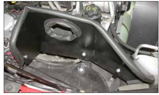
13. Install the heat shield assembly and secure with the provided hardware and the factory air box mounting nut.