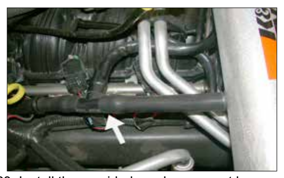
23. Install the provided crank case vent hose onto the factory "TEE" fitting and then onto the K\&N^{@} intake tube as shown.