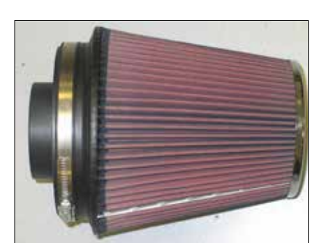
24. Install the filter adapter into the air filter as shown and secure with the provided hose clamp.