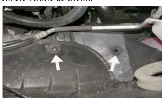
6. Pull the two-air box mounting grommets shown from the inner fender.

5. Lift to dislodge the intake plenum from it's mounting grommets and remove the intake plenum from the vehicle as shown.