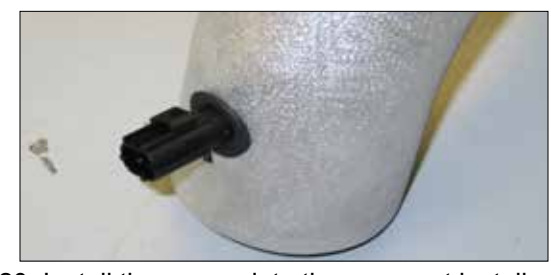
20. Install the sensor into the grommet installed in step #18.