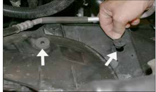
12. Install the two threaded inserts into the air box mounting grommet locations as shown.