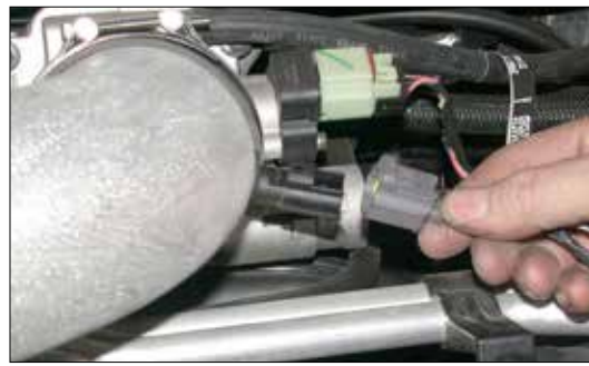
22. Reconnect the air temperature sensor electrical connection as shown.