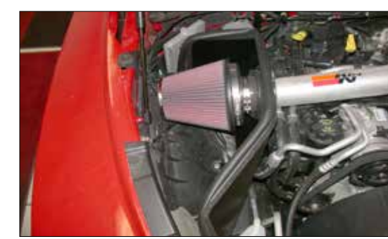
26. Install the air filter assembly onto the K&N<sup>®</sup> intake tube and secure with the provided hose clamp as shown.