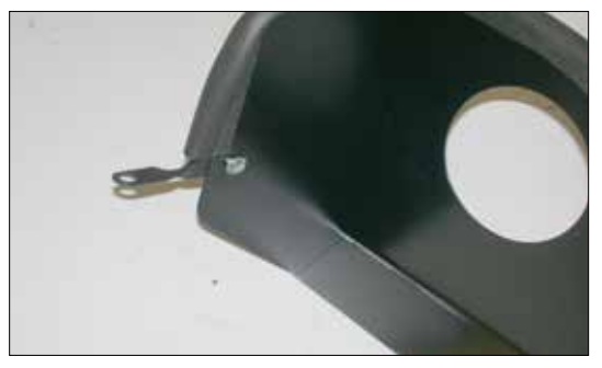
8. Install the twist bracket (070702) onto the heat shield with the provided hardware as shown.