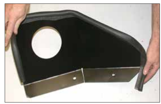
7. Install the provided edge trim onto the heat shield as shown.