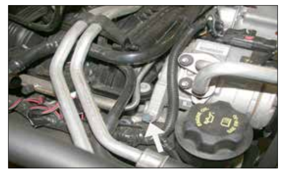
14. Remove the rear, lower A/C compressor mounting bolt shown.