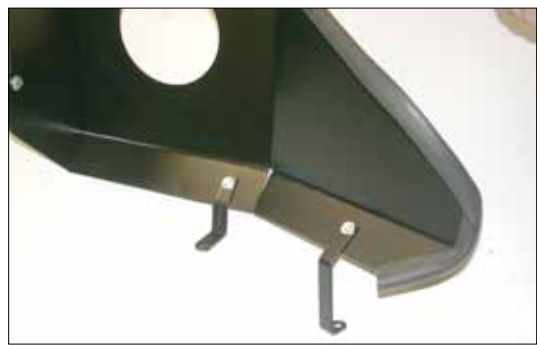
10. Install the "C" bracket (010118) onto the heat shield with the provided hardware as shown.