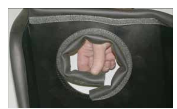
11. Install the provided edge trim onto the heat shield as shown.