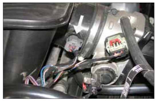
4. Depress the locking tab on the air temperature sensor electrical connection and then pull to disconnect the sensor electrical connection.

NOTE: K&N<sup>®</sup> recommends that customers do not discard factory air intake.