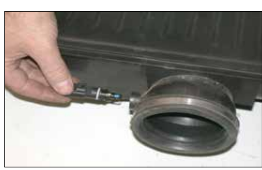
17. Twist the air temperature sensor counter clockwise and remove it from the stock intake plenum.