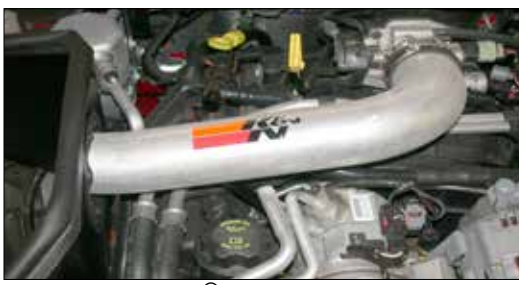
21. Install the K&N<sup>®</sup> intake tube into the throttle body hose and position so the mounting bracket aligns with the tube mounting stand off and then secure with the provided hardware.