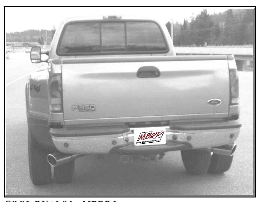
COOL DUALS by MBRP Inc.

Congratulations! You are ready to begin enjoying the improved performance and driving experience of your MBRP Inc. Cool Duals system. We hope you enjoy your purchase.