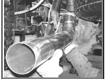
Connect the driver's side tail pipe to the over axle pipe. Lift the tail pipe into approximate position.