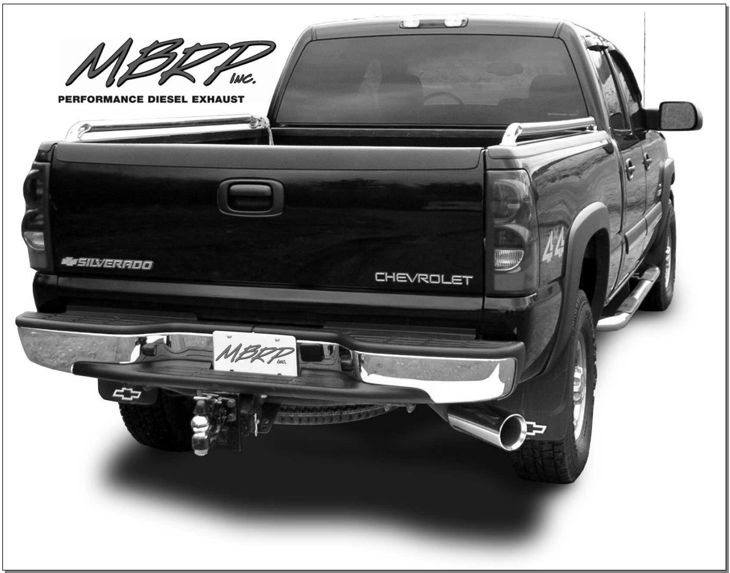
"PRO SERIES" exhaust shown. Tip is not included with "INSTALLER SERIES" or "XP SERIES" kits.

Congratulations! You are ready to begin enjoying the improved performance and driving experience of your MBRP Inc. performance exhaust system. We hope you enjoy your purchase.