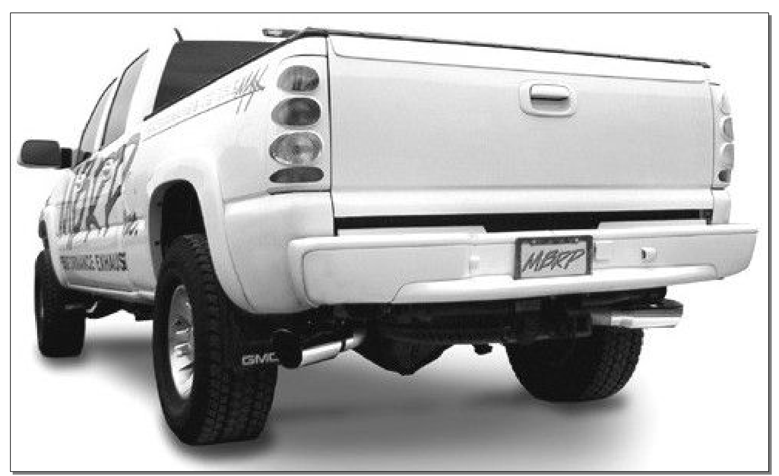
"PRO SERIES" exhaust shown. Tips are not included with "INSTALLER SERIES" or "XP SERIES" kits.

Congratulations! You are ready to begin enjoying the improved performance and driving experience of your MBRP Inc. Cool Duals<sup>TM</sup> System. We hope you enjoy your purchase.