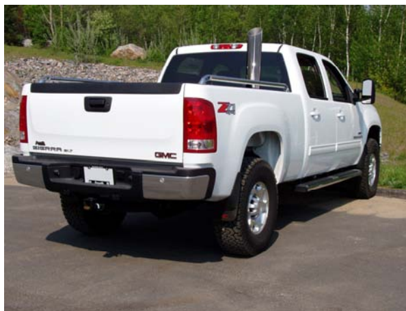
Shown with 6" x 36" Stack (B1610)

Congratulations! You are ready to begin experiencing the improved power, sound and driving excitement of your MBRP Inc. "Smokers™". We know you will enjoy your purchase.