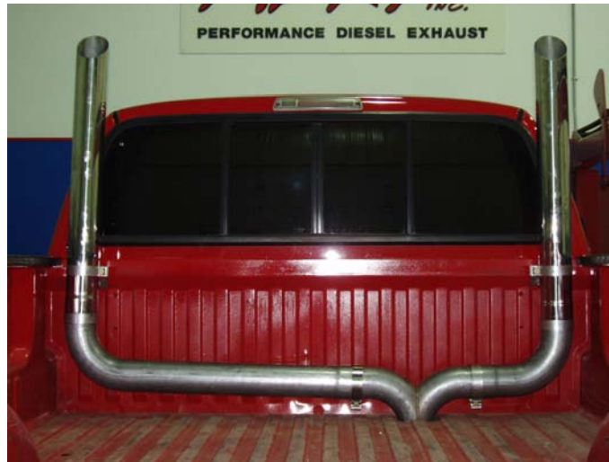
Shown with 4" x 36" Stacks (B1410)

Congratulations! You are ready to begin experiencing the improved power, sound and driving excitement of your MBRP Inc. "Smokers" . We are certain you will enjoy your purchase.