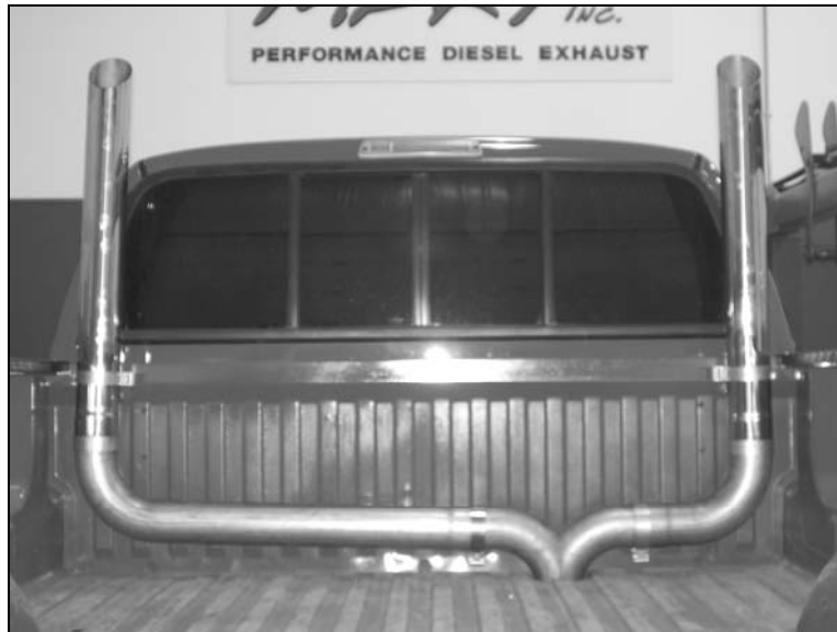
Shown with 4" X 36" Stacks (B1410)

Congratulations! You are ready to begin enjoying the improved performance and driving experience of your MBRP Inc. "Smokers™" . We hope you enjoy your purchase.