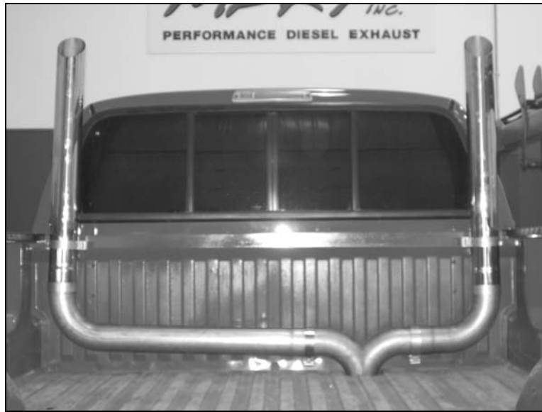
Shown with 4” X 36” Stacks (B1410)

Congratulations! You are ready to begin enjoying the improved performance and driving experience of your MBRP Inc. “ Smokers ™”. We hope you enjoy your purchase.