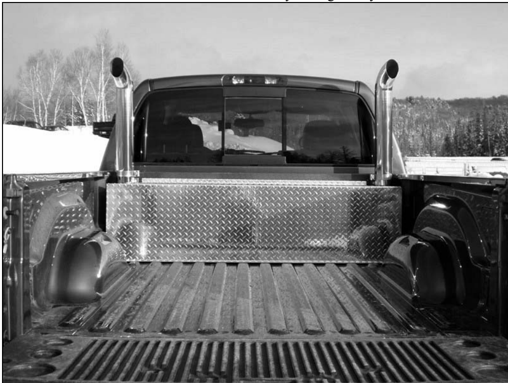
Shown with 4” X 36” Turn Out Stacks (B1430) and Cover (BB002)

Congratulations! You are ready to begin enjoying the improved performance and driving experience of your MBRP Inc. “ Smokers™ ”. We hope you enjoy your purchase.