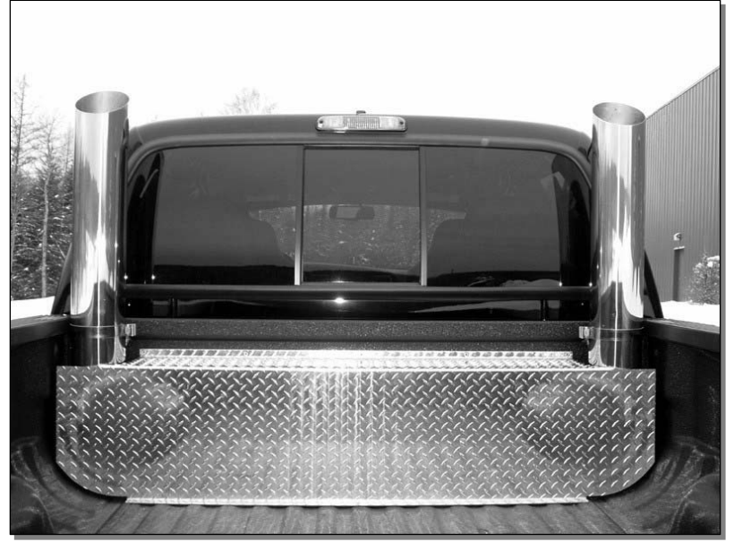
Shown with 6" X 36" Stacks (B1610) and Cover (BB0003)

Congratulations! You are ready to begin enjoying the improved performance and driving experience of your MBRP Inc. " Gmokers <sup>TM</sup>". We hope you enjoy your purchase. 88200 © 03/06