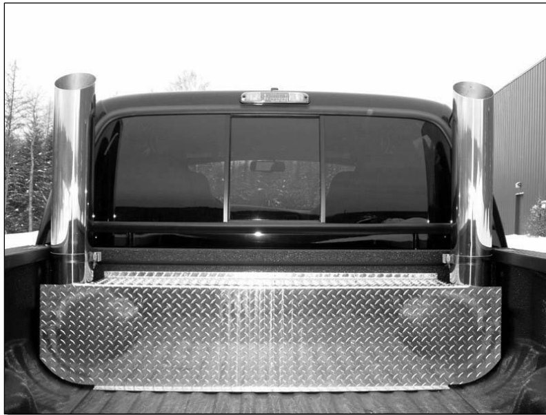
Shown with 6” X 36” Stacks (B1610) and Cover (BB0003)

Congratulations! You are ready to begin enjoying the improved performance and driving experience of your MBRP Inc. “Smokers™” . We hope you enjoy your purchase.