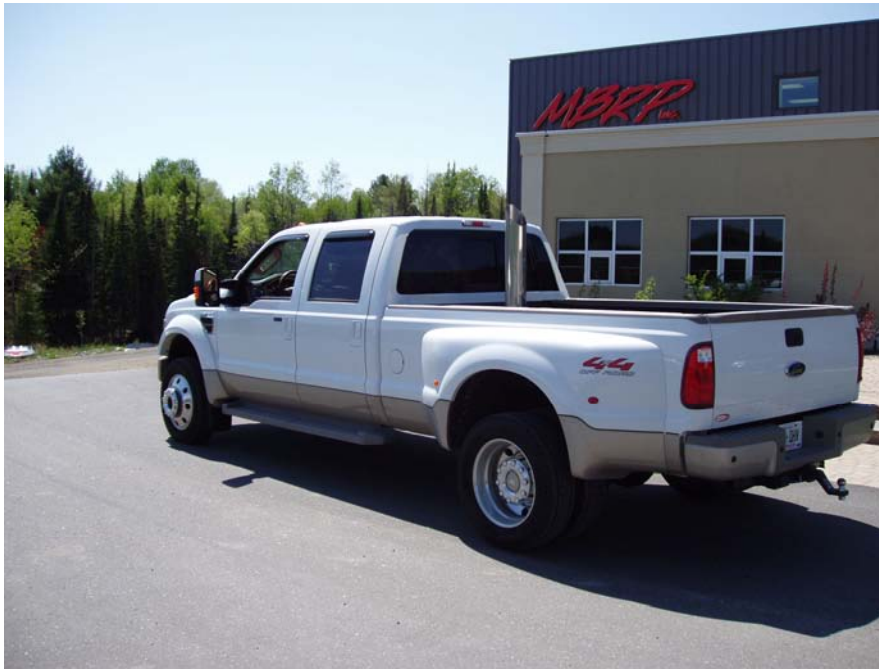
Shown with 6" x 36" Stack (B1610)

Congratulations! You are ready to begin experiencing the improved power, sound and driving excitement of your MBRP Inc. "Smokers™". We are certain that you will enjoy your purchase.