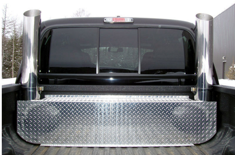
Shown with Checker Plate BB0004

16. Install remaining Clamps around pipes where required. Check along the whole length of the exhaust system to ensure that there is adequate clearance around the fuel and brake lines or any wiring. If any interference is detected, relocate or adjust.