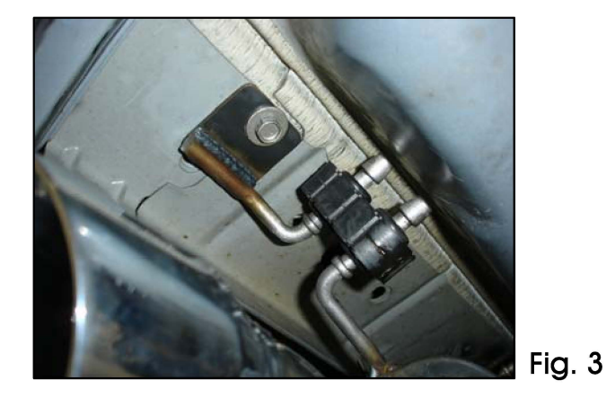
*MAGNAFLOW Performance Exhaust recommends professional installation on all their products

Technical support: 1-800-959-9226 ext. 4500