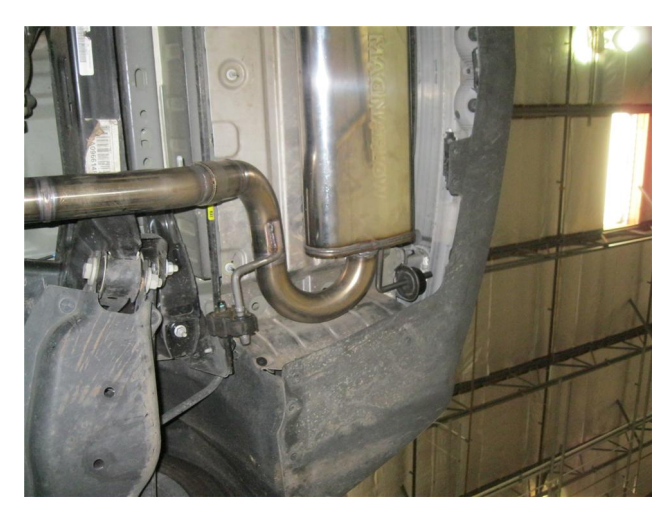
Step 4. Next, install the Muffler Assy to the Inlet Pipe Assembly using a supplied 2.25" clamp and fitting the hangers into the rubber insulators.

Step 3. Begin installation of your new MAGNAFLOW system by attaching the Inlet Pipe Assembly to the cut outlet behind the catalytic converter using the supplied 2.25" clamp (Keep all clamps loose until final adjustment) and insert hanger into rubber insulator.