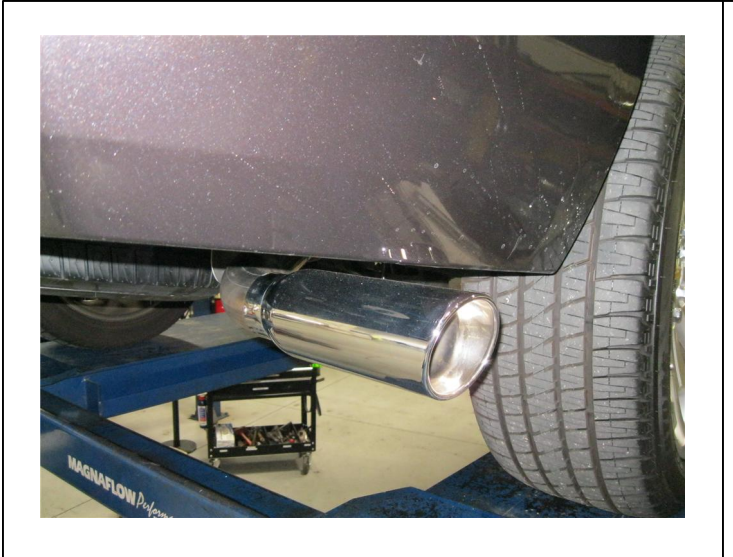
Step 4. Once a final position has been chosen for the new exhaust system, evenly tighten all clamps from front to rear using the torque specifications on page one of the instructions. Inspect all fasteners after 25-50 miles of operation and re-tighten if necessary.