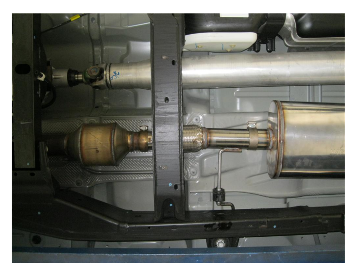
Step 2. Begin installation of the new system by attaching Inlet Pipe Assembly at the ball flare using the OEM clamp and fitting the hanger into the rubber insulator. Next attach the muffler to the inlet pipe using a supplied 3.00" clamp. Leave all clamps loose for final adjustment of the complete system.