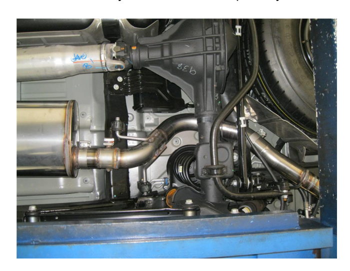
Step 3. Complete the initial installation by attaching the Extension Pipe Assembly (containing the exhaust valve) to the Muffler and the Resonator/Tailpipe Assembly the Extension Pipe using the suplied 3.00" clamps.