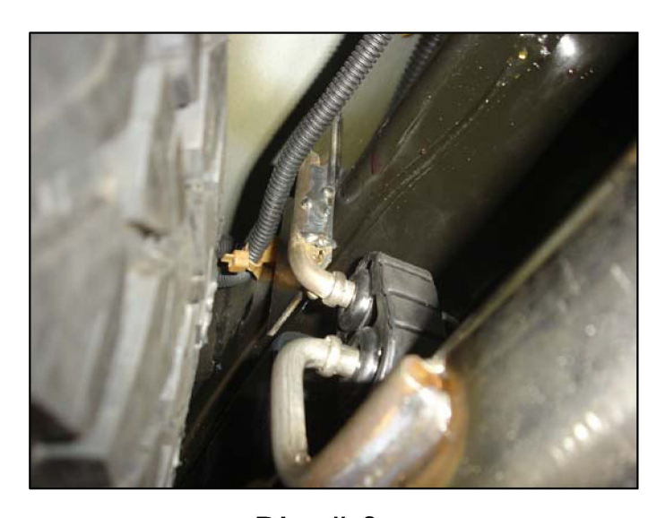
Dia # 3

Warning: When working on, under, or around any vehicle exercise caution. Please allow the vehicle's exhaust system to cool before removal, as exhaust system temperatures may cause severe burns. If working without a lift, always consult vehicle manual for correct lifting specifications. Always wear safety glasses and ensure a safe work area. Serious injury or death could occur if safety measures are not followed.