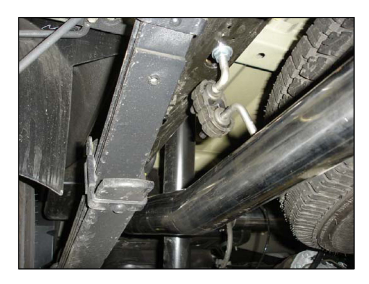
Dia # 2