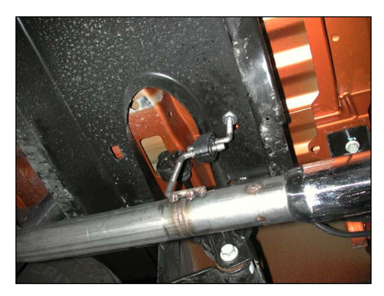
FIG. 1 - Passenger's side

Warning: When working on, under, or around any vehicle exercise caution. Please allow the vehicle's exhaust system to cool before removal, as exhaust system temperatures may cause severe burns. If working without a lift, always consult vehicle manual for correct lifting specifications. Always wear safety glasses and ensure a safe work area. Serious injury or death could occur if safety measures are not followed.