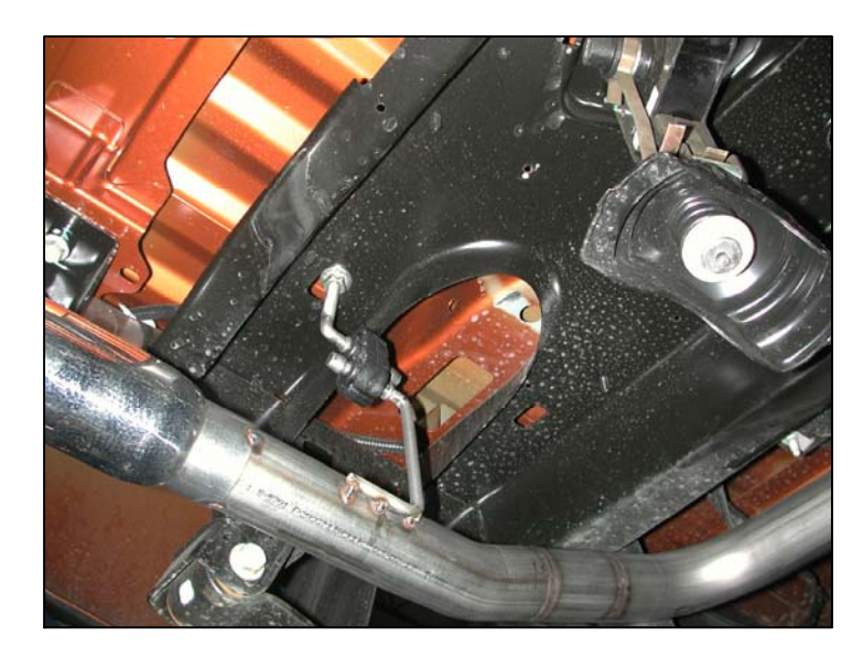
FIG. 2 - Driver's side

Step 4: Once a final position has been chosen for the new system, evenly tighten all fasteners from front to rear. Inspect all fasteners after 25-50 miles of operation and retighten if necessary.