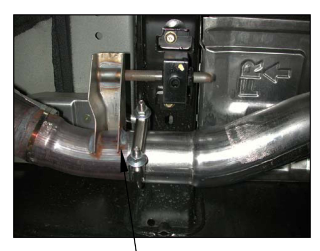
CUT 4" BEHIND THIS BRACKET

Warning: When working on, under, or around any vehicle exercise caution. Please allow the vehicle's exhaust system to cool before removal, as exhaust system temperatures may cause severe burns. If working without a lift, always consult vehicle manual for correct lifting specifications. Always wear safety glasses and ensure a safe work area. Serious injury or death could occur if safety measures are not followed.