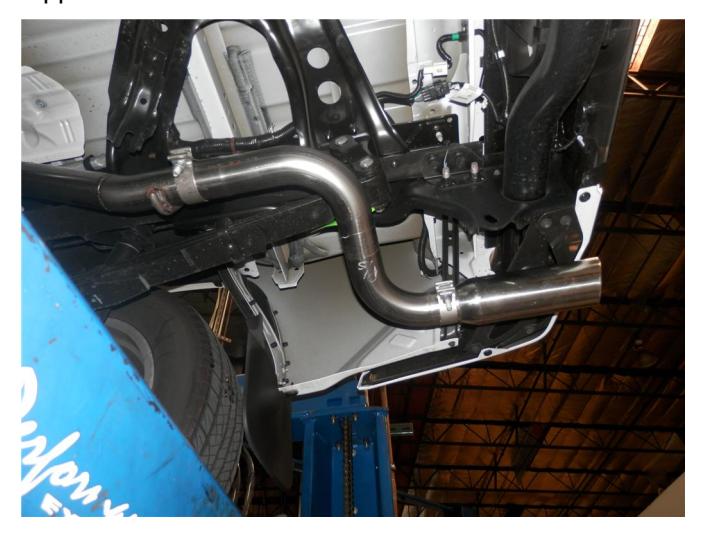
Step 4. Attach the Tail Pipes to the system using the supplied 2.50" clamps. Install the tips using a similar fashion.

Step 3. Attach the supplied Hanger Bracket Assembly to the vehicles subframe using the Bracket Plate and supplied hardware. There is an existing hole in the subframe located on the drivers side. Loosely install both Inlet Pipes to the muffler Assembly using the supplied 2.50" clamps and engaging the welded hangers to the rubber insulators. Install the Mid Pipe Assembly in a similar fashion locating the welded hanger to the Hanger Bracket Assembly you previouisly installed using the supplied Rubber Insulator.