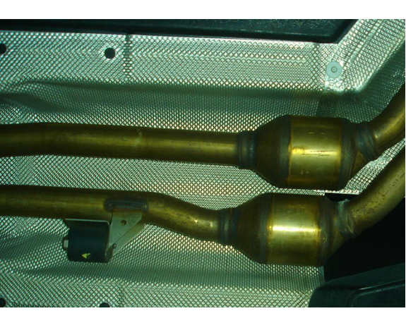
** Magnaflow Performance Exhaust recommends professional installation on all their products

Warning: When working on, under, or around any vehicle exercise caution. Please allow the vehicle's exhaust system to cool before removal, as exhaust system temperatures may cause severe burns. If working without a lift, always consult vehicle manual for correct lifting specifications. Always wear safety glasses and ensure a safe work area. Serious injury or death could occur if safety measures are not followed.