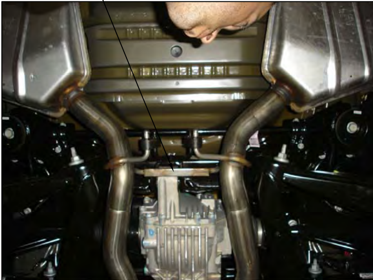
Fig. # 1

Step 5: Once a final position has been chosen for the new system, evenly tighten all fasteners from front to rear. The supplied band clamps must be VERY tight to properly align the pipes and prevent leaks (Approximately 65ft-lbs). U-bolt clamps should be tightened to approximately 30-35ft-lbs. Inspect all fasteners after 25-50 miles of operation and retighten if necessary.