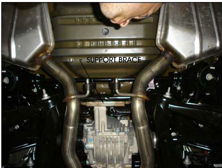
Fig. # 1

Step 5: Once a final position has been chosen for the new system, evenly tighten all fasteners from front to rear. The supplied band clamps must be VERY tight to properly align the pipes and prevent leaks (Approximately 65ft-lbs). U-bolt clamps should be tightened to approximately 30-35ft-lbs. Inspect all fasteners after 25-50 miles of operation and retighten if necessary.