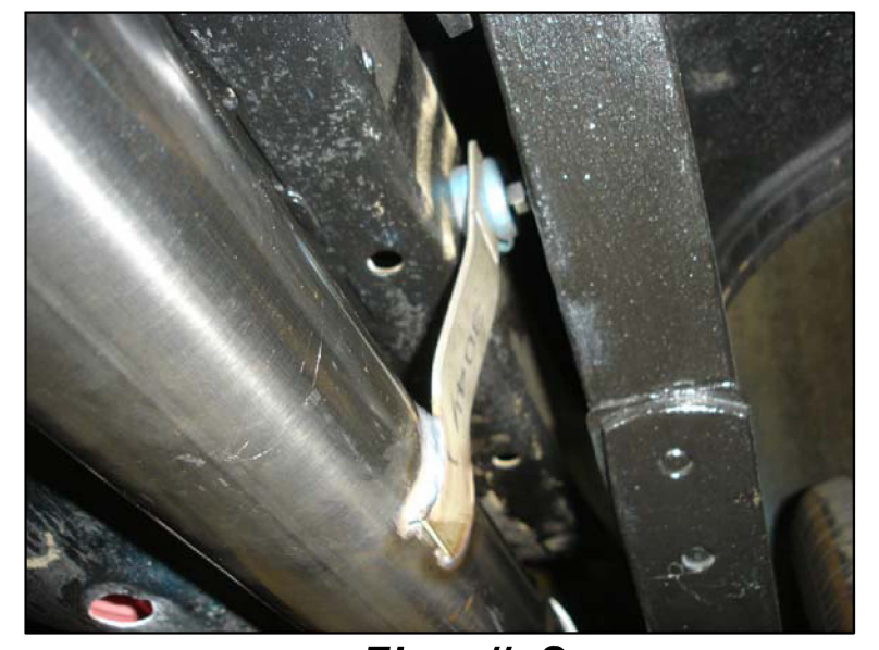
Fig. # 2

Step 7: Once a final position has been chosen for the new system, evenly tighten all fasteners from front to rear. Inspect all fasteners after 25-50 miles of operation and retighten if necessary.