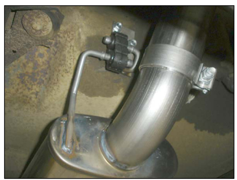
Fig. # 1

Step 5: Slip the over axle pipes over the muffler assembly outlet pipes. Secure with the supplied clamps.