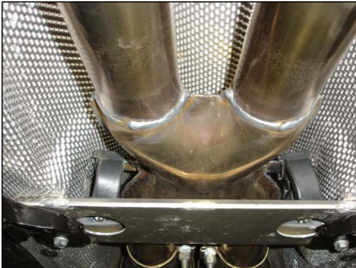
Fig # 2

Step 5: Once a final position has been chosen for the new system, evenly tighten all fasteners from front to rear. The supplied band clamps must be VERY tight to properly align the pipes and prevent leaks (Approximately 40ft-lbs). U-bolt clamps should be tightened to approximately 30-35ft-lbs. Inspect all fasteners after 25-50 miles of operation and retighten if necessary.