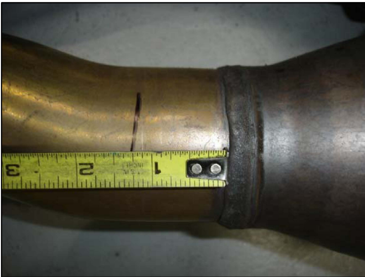
Fig # 1

Warning: When working on, under, or around any vehicle exercise caution. Please allow the vehicle's exhaust system to cool before removal, as exhaust system temperatures may cause severe burns. If working without a lift, always consult vehicle manual for correct lifting specifications. Always wear safety glasses and ensure a safe work area. Serious injury or death could occur if safety measures are not followed.